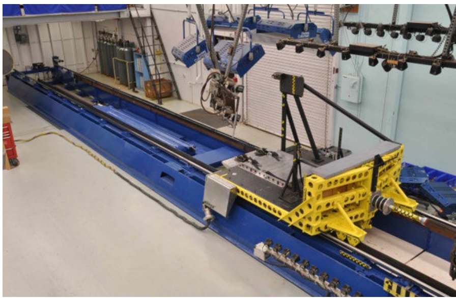
Figure 1 – UMTRI's sled impact facility