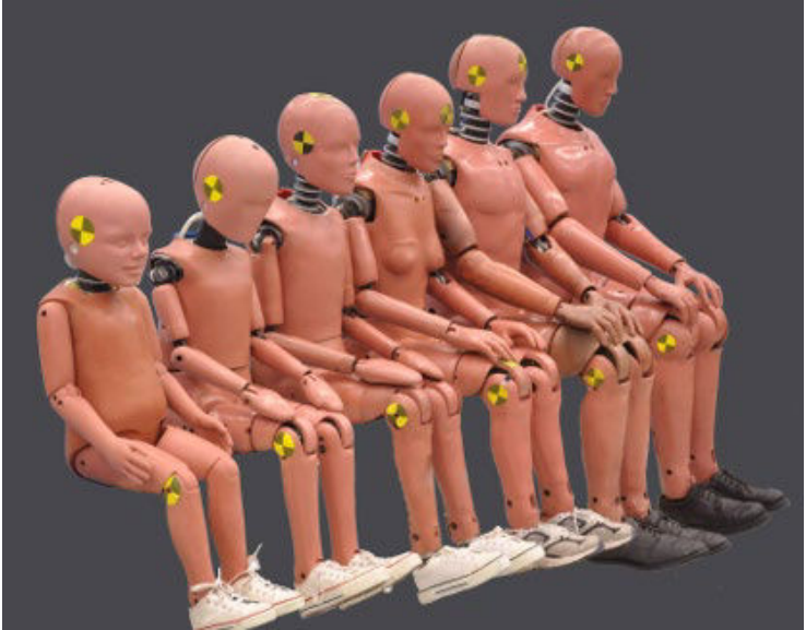
Figure 3 – UMTRI's crash-test dummies

For WTORS that are designed for limited use with pediatric or manual wheelchairs and/or children having a body mass that is considerably less than that of an adult, one of the smaller ATDs, such as the small female, 10-year old, or 6-year old might be the appropriate size ATD to use along with the a representative commercial wheelchair rather than the surrogate wheelchair. UMTRI sled engineers will provide manufacturers with advice on the appropriate size ATD to use and any product labeling requirements or warning literature related to the limited use of the WTORS.