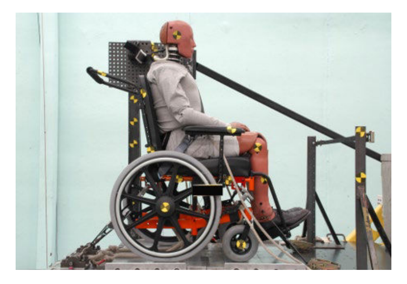
Figure 5 – Wheelchair secured facing forward on the UMTRI sled using the surrogate four-point, strap-type tiedown

Manufacturers may also choose to conduct "due-care" tests of their wheelchairs using a threepoint belt restraint with the lap belt anchored to the sled platform. For these tests, UMTRI provides a complete surrogate vehicle-anchored lap/shoulder belt restraint system.