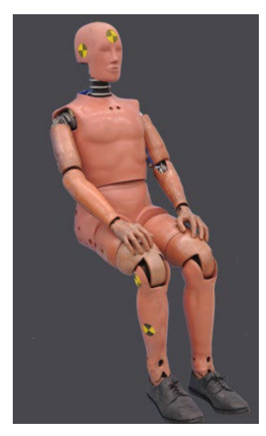
Figure 4 – Midsize Adult Male Hybrid III ATD (crash-test dummy)

For pediatric wheelchairs, the small-female ATD (nominally104 lb) is often the appropriate choice, but the new Hybrid III 10-year old ATD or the 6-year old ATD may also be appropriate for some wheelchair models and/or restraint conditions. For wheelchairs intended for use by children who weigh less than 50 lb (23 kg), testing to WC19 requires that the 3- or 6-year-old Hybrid III ATD is restrained only by a commercially available wheelchair-integrated five-point restraint harness provided by the wheelchair manufacturer. Additional mass can also be added to most ATDs to simulate an occupant mass that is between the standard ATD masses listed in Table 1. However, for WC19 testing, additional mass is only used to increase the mass of the small-female ATD to 130 lb for wheelchairs and seating systems designed for people with a body mass ranging from 125 to 165 lb. All other testing to U.S. standards with ATDs having augmented mass is considered to be "due-care" testing and not testing to the standards.