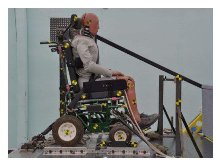
Figure 7 – Manufacturer's seating system installed on the surrogate wheelchair frame (SWCF) secured facing forward on the UMTRI sled by the surrogate four-point, strap-type tiedown and loaded with a Hybrid-III midsize-male ATD

The SWCF with seating system installed is placed facing forward on the sled platform and secured by the surrogate four-point, strap-type tiedown system specified in Annex D of WC19. The securement hooks of the rear tiedown strap assemblies are attached to the lower rear securement points provided on the SWCF and the front tiedown hooks are attached to the front securement points. An appropriate size ATD is placed in the seating system based on information from the manufacturer about the user capacity of the seating system, and the ATD is restrained using a three-point belt restraint system consisting of an SWCF-anchored lap (WC19) or a vehicle/sled-anchored lap belt (ISO 16840-4 allows testing with either a vehicle-anchored or SWCB-anchored lap belt) and a diagonal shoulder belt. Additional "due-care" WC19 tests may also be conducted using a surrogate three-point belt restraint with a lap belt anchored to the sled platform.