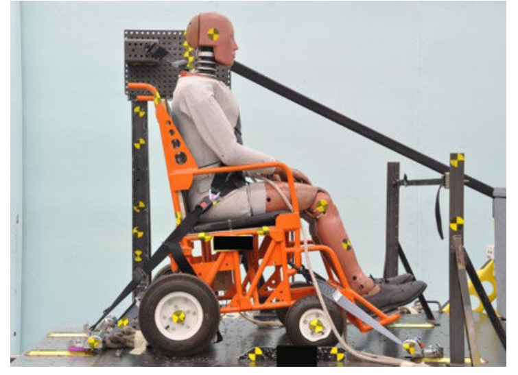
Figure 6 – 187-lb surrogate wheelchair (SWC) loaded with the Hybrid III midsize-male ATD retrained by a commercial lap/shoulder-belt restraint and secured facing forward on the UMTRI sled by the WTORS manufacturer's strap-type tiedown system

In cases where a WTORS has been designed for limited use with a specific wheelchair and/or occupant because of special wheelchair features required for securement or lower wheelchair mass, the sled impact test is conducted with a representative sample of the production wheelchair model rather than with the SWC. In these cases, the test is a "system" test that evaluates the dynamic strength of the WTORS-plus-wheelchair system , and the WTORS must be clearly labeled to indicate the limitations of its use.